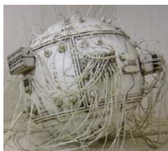
Complex legacy systems

These activities require significant investment. Speed in achieving this change is critical to ensure an organisation starts reaping the benefits of their investment.